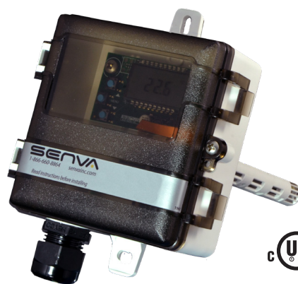
NEW! TGD Toxic Gas sensor for Duct applications