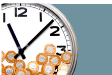
Senva Autoset™ and Preset™ sensors save a minimum of 15 minutes per install compared to other adjustable sensors.