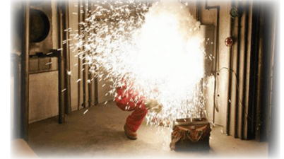
Click here to see 480V arc flash demo

Working with current sensors that require manual calibration in a live enclosure can put installing technicians in situations where they can be unnecessarily exposed to potential arc flash hazards.