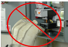
No guesswork. Manual multi-turn adjustments are a thing of the past.