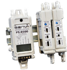
High capacity DIN mount saves valuable panel space