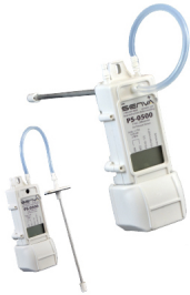
Innovative probe. Transforms for duct or remote application.