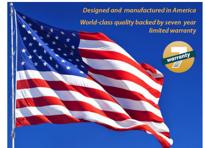
Made in the USA and backed by a seven year limited warranty