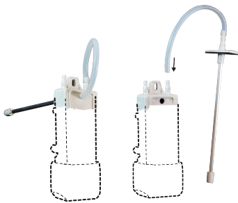
Versatile probe and 6" long 1/16 tube