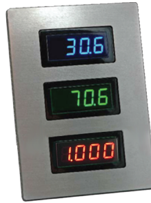
Dual and Triple Versions Available