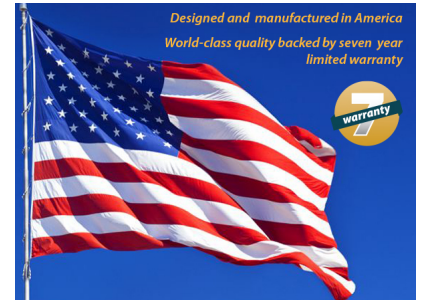
Buy American Act Compliant