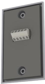
Gasket seals element from wall drafts. 45 degree terminals for ease of wiring. save time and energy.