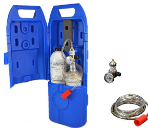
Calibration kit available