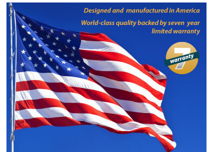
Buy American Act Certified