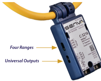
4 ranges with universal outputs