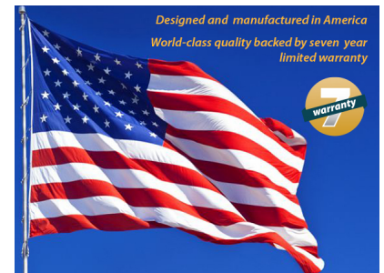
Buy American Act Certified