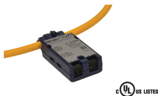
RoFlex universal output current transducer