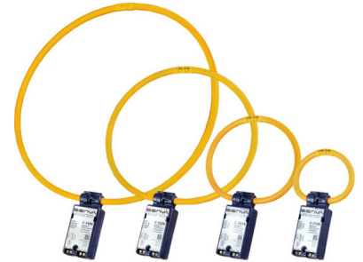
Measure up to 6000A with ease