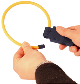
Flexible split-core rogowski CTs are easy to install and don't saturate like iron core